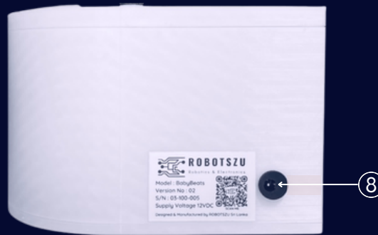
⑧ Power Jack